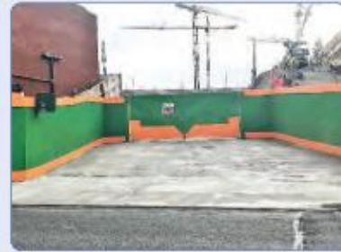
▲ NEW MOUNT BROWNE ENTRANCE/EXIT

More information on the new entrance/exit at can be found on the back page of this newsletter.